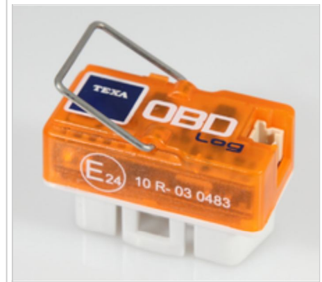
TEXA OBD log. Small data logger with the possibility to read out the data later on PC via USB.