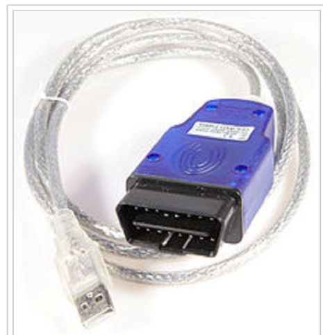
Typical simple USB KKL Diagnostic Interface without protocol logic for signal level adjustment.

The extent that a PC tool may access manufacturer or vehicle-specific ECU diagnostics varies between software products as it does between hand-held scanners.