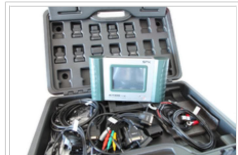
Multi-brand vehicle diagnostics system handheld Autoboss V-30 with adapters for connectors of several vehicle manufacturers. [16]